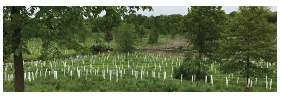
Woodlands restored with new seedlings.

For more information about the cost-share program or to discuss possible projects, call Kent Wolf at 218-846-8281 or email <u>kent.wolf@state.mn.us</u>. Complete information about the program can be found on the DNR's Cost-share for Woodland Owners webpage.