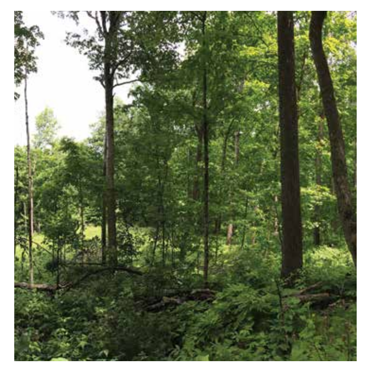
Hardwood replacement options for ash.

It is important to fully understand your woodland before taking management actions. This webpage (<u>extension.</u> <u>umn.edu/forest-pests-and-diseases/managing-ash-</u> <u>woodlands</u>) highlights the importance of a woodland inventory before identifying any management actions for ash in your woodland. The resource describes common timber harvest and regeneration systems in addition to ways to increase non-ash species in your woodlands.