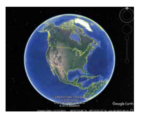
Google Earth Pro view of North America.