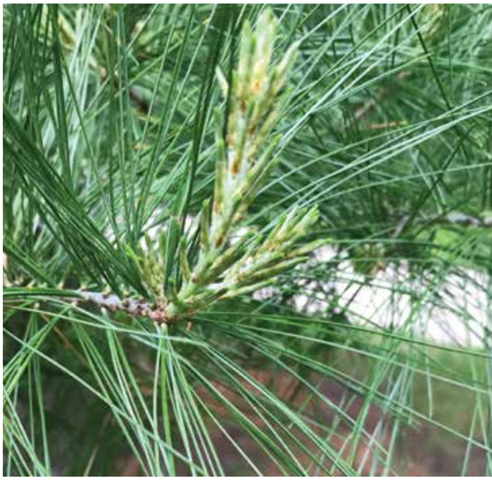
Top: White pine seedling. Bottom: Close up of white pine.

This program is supported and co-sponsored by Sugarloaf: The North Shore Stewardship Association.