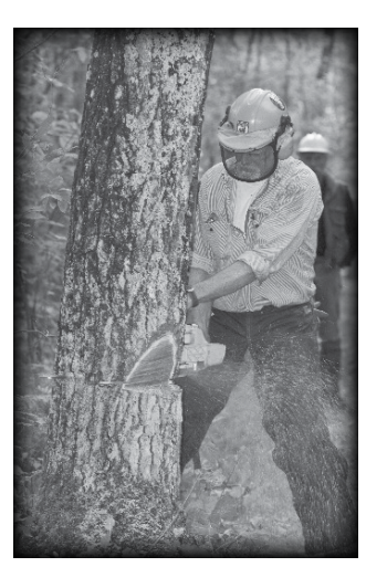
Above: Oh, Oh! No safety chaps being worn!

Right: Demonstrating a Logrite ATV Arch.