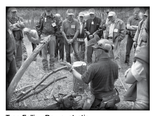
Tree Felling Demonstration