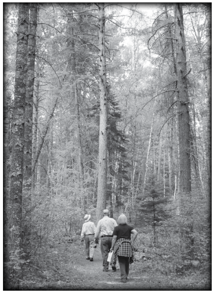
Tour of the Lost 40