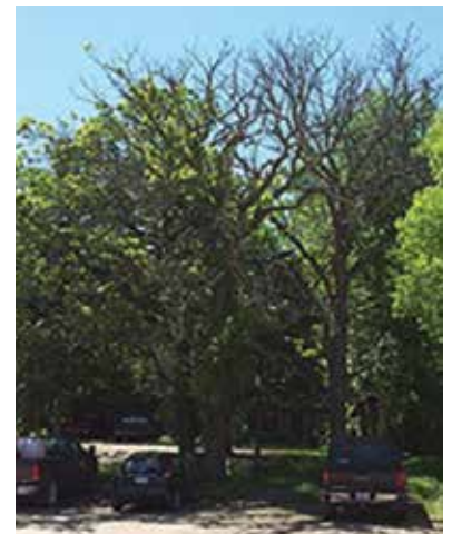
Declining bur oak in Kandiyohi County from soil compaction, drought, excess rainfall and old age.

Take our Minnesota Woodlands survey on page 7 or on our website!