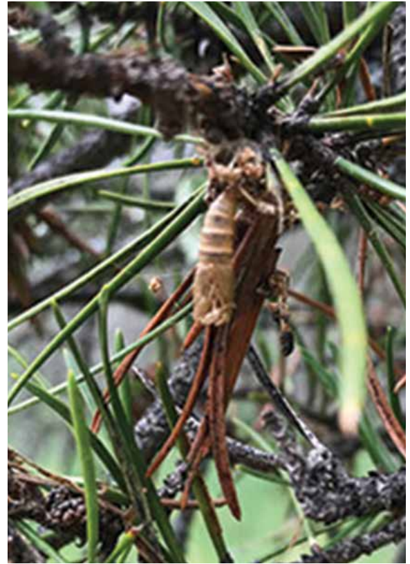
Close-up of a jack pine budworm.

Be sure to keep your eye on your jack pine, and if you are seeing signs of budworm, plan to manage accordingly.