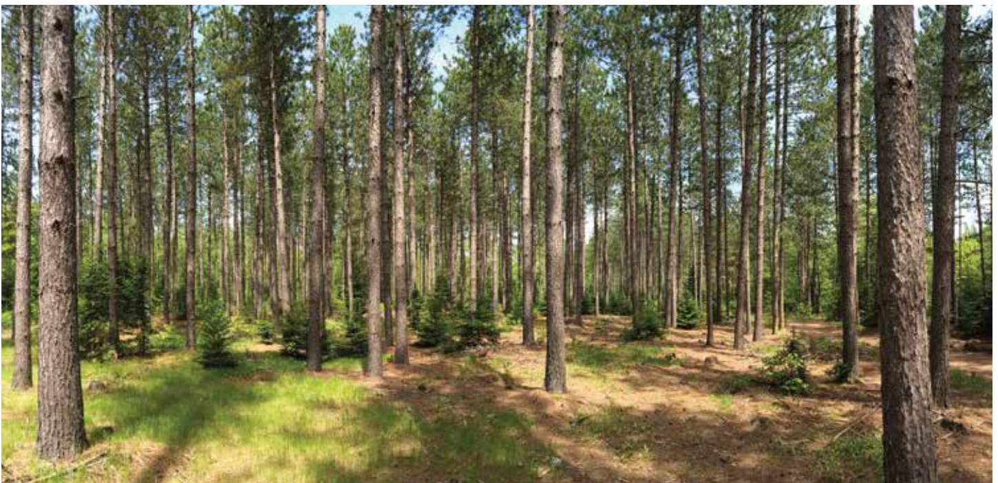
Red pine plantation, thinned twice, southern Carlton County, Minnesota.

Consult published stocking guidelines or density management diagrams for your tree species of interest.