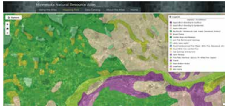
The Minnesota Natural Resource Atlas, mnatlas.org/gis-tool/

This spring's production far exceeded previous years. Over 100 gallons of syrup were produced compared to