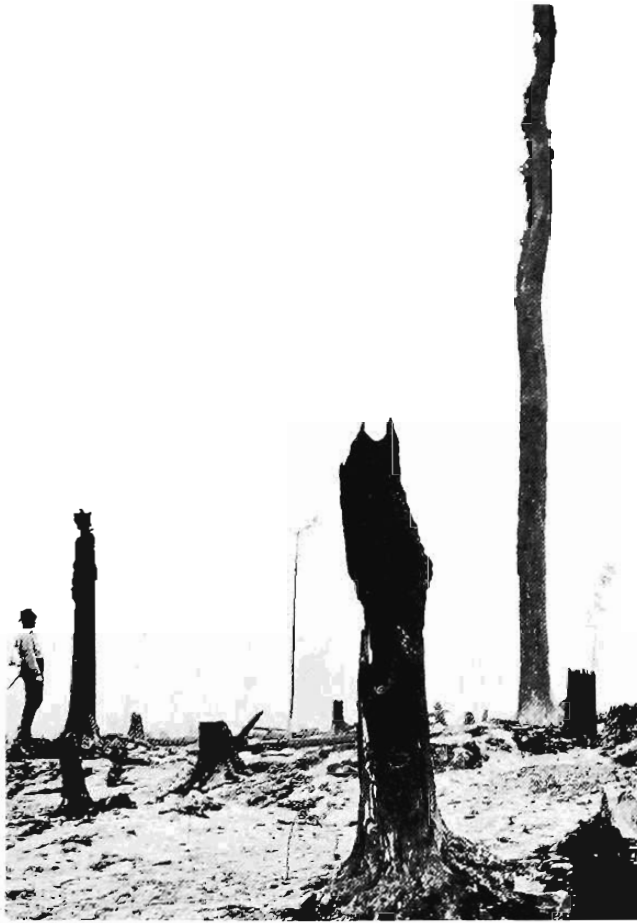
BLACKENED STUMPS and charred trunks are all that remain in this photograph after a devastating forest fire in northern Minnesota.

exploitation and its often haphazard results, he deftly substituted a plan for orderly development and exploitation under government supervision. Justification for forest reserves rested entirely on economic grounds. Reserves would prevent a needless waste of resources. They would prevent forest fires, provide raw materials for a permanent lumber industry, promote railroads and other wood-using industries, preserve water supplies essential to agriculture and navigation, and assure that cutover land would be reforested or settled wherever appropriate. Fernow's plan set the tone for the Minnesota State Forestry Association's program to protect forest lands "as a source of continual revenue and forest products to the public." 37