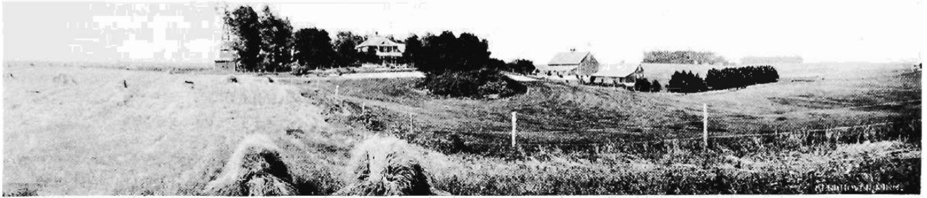
WINDBREAKS were commonly planted around farms and homes, as this photograph shows.

values established by the founding fathers. Nothing less than democracy itself seemed to be at stake. In the agrarian past, universal property holding had guaranteed opportunities and liberties that were roughly equal for all. Until the 1880s Americans thought of themselves as members of a large community, more alike than different in its parts, and quite distinct from European societies. But now millions of individuals in the nation's cities owned no property, spoke little English, worshiped in non-Protestant churches, and had no idea how the democratic system operated. These new social realities seemed to be the very European ailments to which Americans had long believed themselves immune. The result was a sense of cultural crisis that lasted until the Spanish-American War of 1898. 17