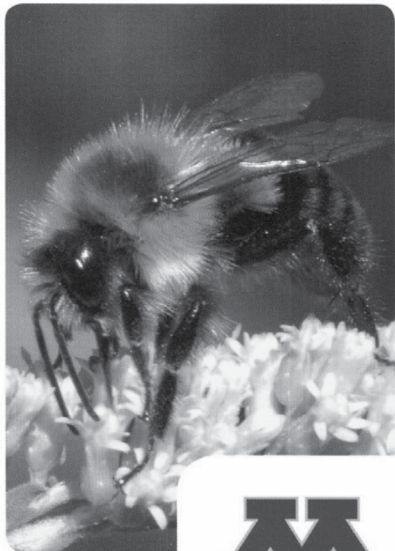
Eastern bumble bee