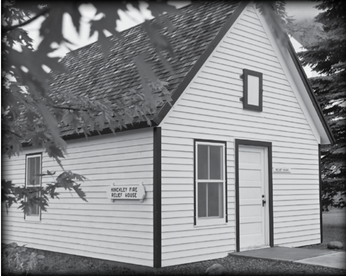
Relief House Photo – caption: Relief houses were built for fire survivors. This reproduction was built by museum volunteers with donated materials.