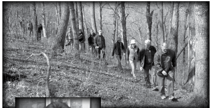
Above: Friday's events included an excursion to the Lost Creek Hiking Trail near Chatfield.