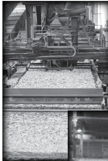
Left: Norbord's plant

There is a bright spot for the timber industry. Paper