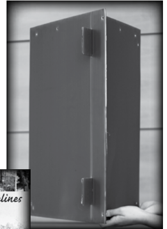
Above: 4,500 of these purple Barney traps were hung in Minnesota trees this summer.

The traps are not meant to catch enough beetles to reduce their number. Rather, they are designed to detect the leading edge of an ash borer infestation. If officials know where the beetles are, and where they are going, they have a chance to slow them down.